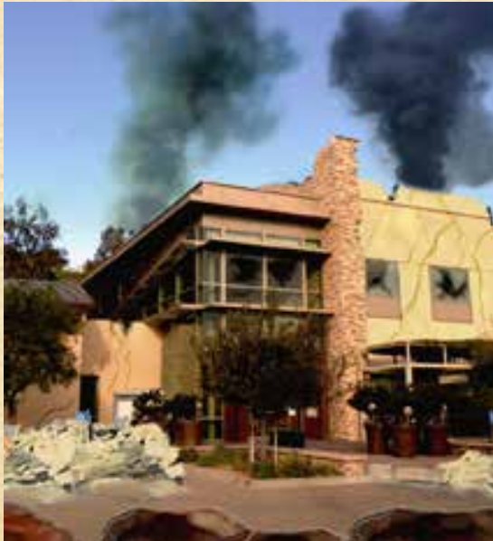
Mission Viejo City Hall Earthquake Artist Depiction

Earthquakes, floods, wildfires and landslides are the most likely hazards to occur in Mission Viejo. The Emergency Operations Plan is the planning document that guides Mission Viejo's emergency planning and response efforts during a disaster. In the event of a local emergency or large-scale disaster, City staff will report to the Emergency Operations Center at City Hall to coordinate disaster response operations.