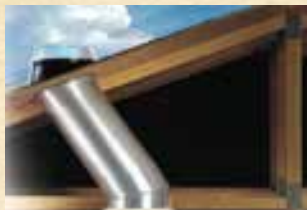
A Solar Tube installation

One of her pet projects is solar tubes, which she calls the gift that keeps on giving. Now, a solar tube is not a skylight; it is a tube with a prism that sits on your roof and captures sunlight all day long and brings that light to interior spaces by a process called