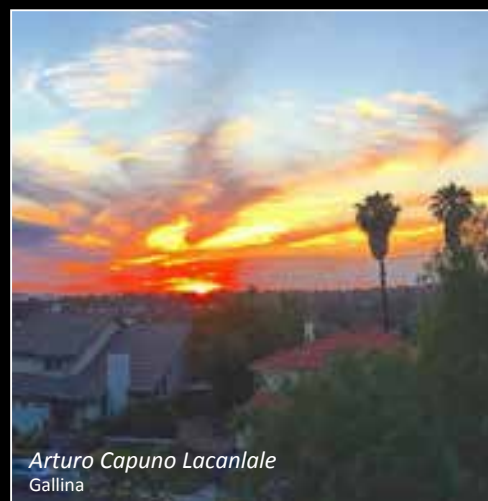
Arturo Capuno Lacanlale Gallina