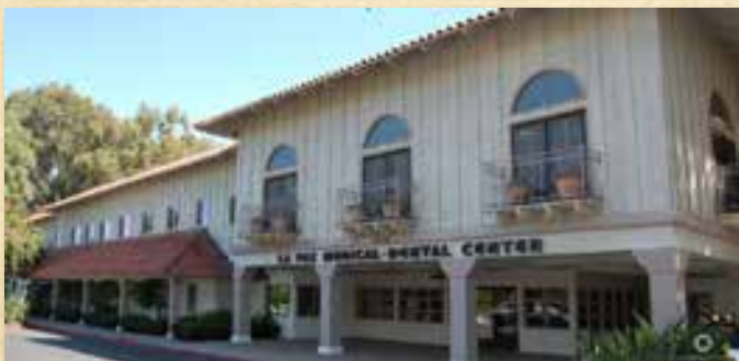
La Paz Medical Center as it looks today