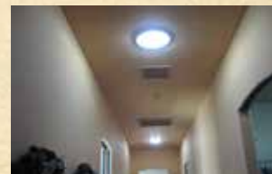
A Solar Tube installation