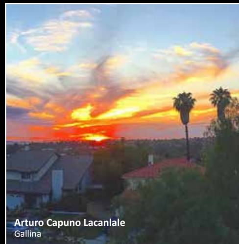
Arturo Capuno Lacanlale Gallina