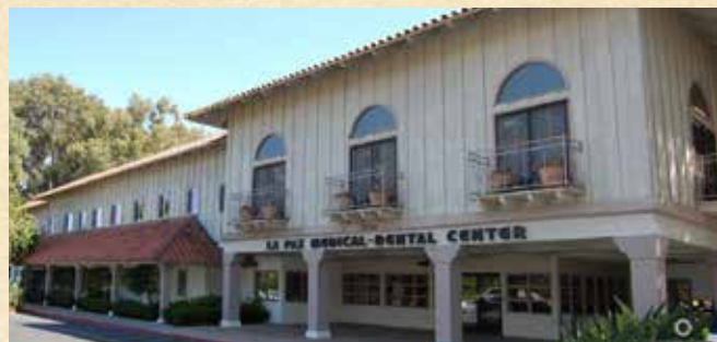
La Paz Medical Center as it looks today