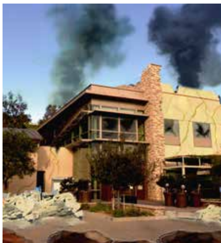
Mission Viejo City Hall Earthquake Artist Depiction

Mission Viejo also encourages our residents to take part in its award-winning Community Emergency Preparedness Academy (CEPA). The academy is a 27-hour comprehensive course in neighborhood preparedness. Contact the City at CEPA@cityofmissionviejo.org or 949-470-8433 for class availability.