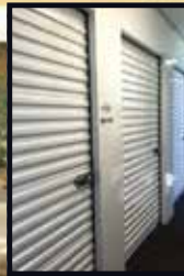
Ground level storage units inside a clean, safe environment