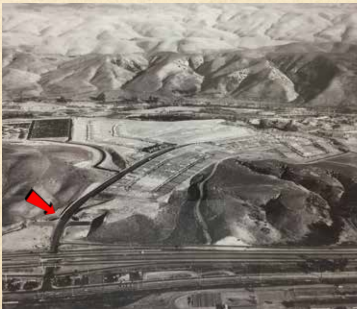
Avery Parkway and Marguerite Parkway 1967