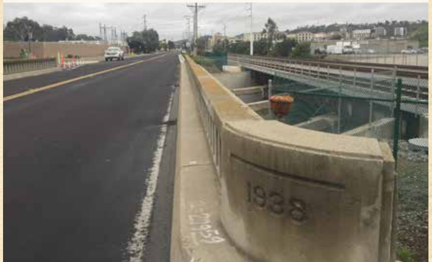
Signs of the Old Highway 101 remain, this bridge built in 1938 is near Mugs Away Saloon.

Old US 101 is perhaps the most historic highway in California. It follows the route that Spanish explorer Juan Gaspar de Portola followed in 1769, and later became El Camino Real, (also known as the King's Highway). The old trail linked the 21 Spanish missions. This historic road served as the main north/south road in California until 1959, when the Interstate 5 was completed.