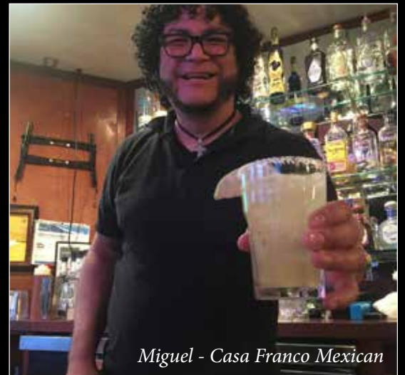
Miguel - Casa Franco Mexican