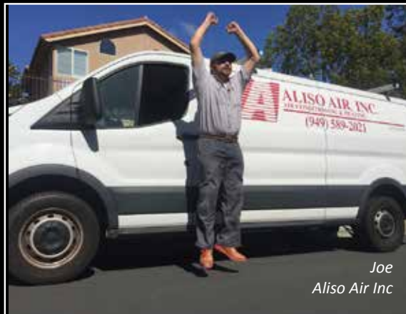
Joe Aliso Air Inc