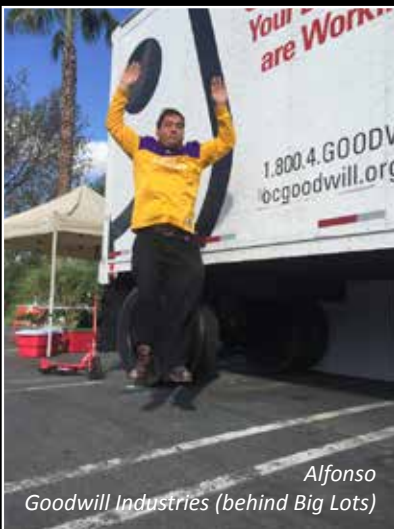
Alfonso Goodwill Industries (behind Big Lots)