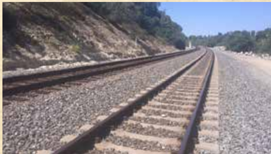
The highest point of elevation on the entire San Diego line is in Mission Viejo, at milepost 189 near Alicia Parkway.