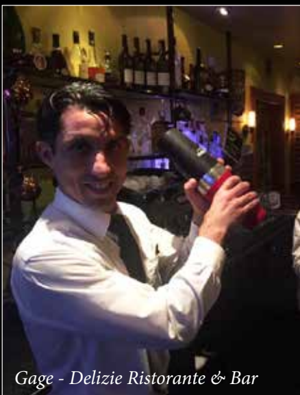
Gage - Delizie Ristorante & Bar