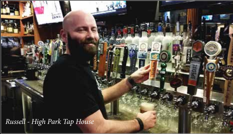
Russell - High Park Tap House