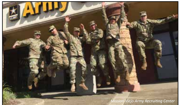
Mission Viejo Army Recruiting Center