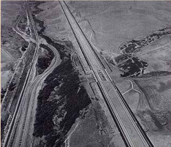
The Galivan Whistle Stop at Oso after its removal. On the left is the Santa Fe train tracks, to the right is Camino Capistrano (US101). Far right, is the newly built I-5 (photo from 1959).

The old Galivan Overhead Whistle Stop served traffic on US 101 for 32 years between 1927 and 1959. It was removed in 1959, due to the San Diego Freeway (I-5) construction. It was located just south of Oso Parkway, and has now been covered by Cabot Road. The highest point of elevation on the entire Los Angeles to San Diego line is in Mission Viejo at milepost 189 near Alicia Parkway.