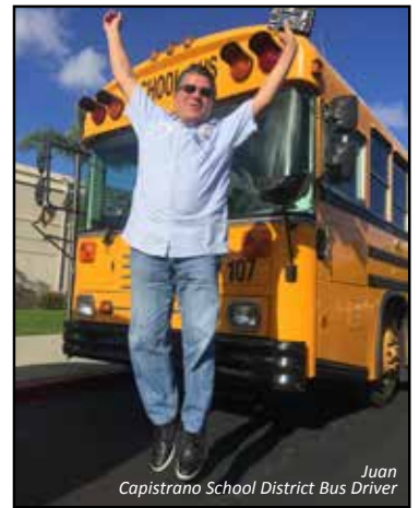
Juan Capistrano School District Bus Driver

The following pages include some of the most important people in Mission Viejo, people that make our city great.