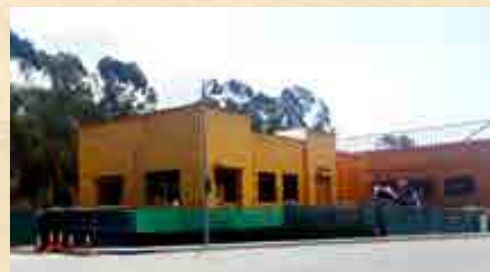
Current state of construction.

Coco's has relocated to 28520 Marguerite Parkway, next door to Mission Viejo Reporter Headquarters at 28570 Marguerite Parkway.