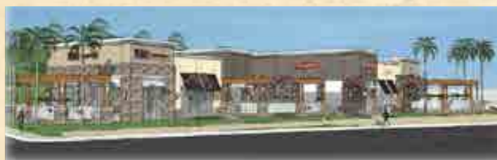
Artist's rendering of the new buildings on location