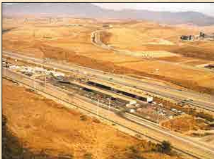
1972 - Above Allen Cadillac looking towards Mission Viejo