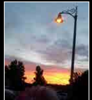
Elsie Griffith Holdridge