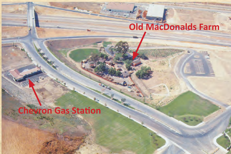
Old Mac Donald's Farm was located at Crown Valley/5 Frwy., right where the Kaledioscope sits today

FAMOUS SOUTHERN CALIFORNIA ATTRACTION HAD A HOME IN MISSION VIEJO FOR A SPELL