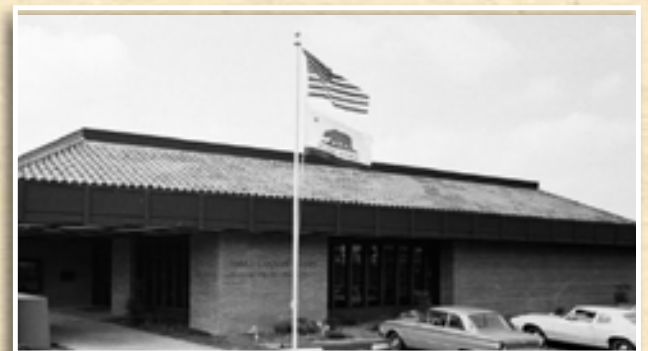
Mission Viejo Library - 1970