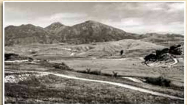
Somewhere on Marguerite Parkway - 1965