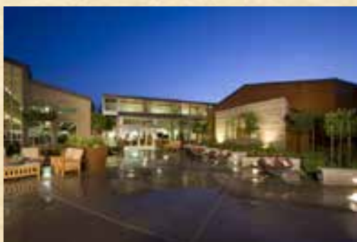
Norman P. Murray Center in Mission Viejo