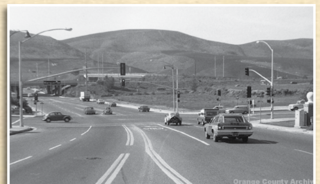
Intersection of Avery and Marguerite Parkways - 1972